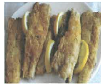
Grilled hake fish